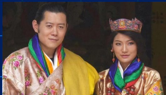
Bhutan King Jigme Khesa Wangchuck and Queen Jetsun Pem